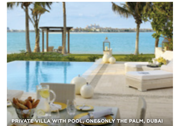
PRIVATE VILLA WITH POOL, ONE&ONLY THE PALM, DUBAI

Some travellers are searching for the ultimate in discreet solitude. In Dubai, One&Only Royal Mirage delivers virtual secrecy with its luxurious private enclave, only accessible from its own driveway with service provided by an elite villa team. Guests can close out the world to make important decisions; slip into the pool or succumb to a spa treatment. Alternatively in Dubai, One&Only The Palm has a distinctive island atmosphere, guests often arrive by yacht taking up residence in the ultimate Beachside Villa Residences with pools to revive in the sun, lulled by the folding waves. Charlotte Olympia heels or barefoot chic are equally suited.