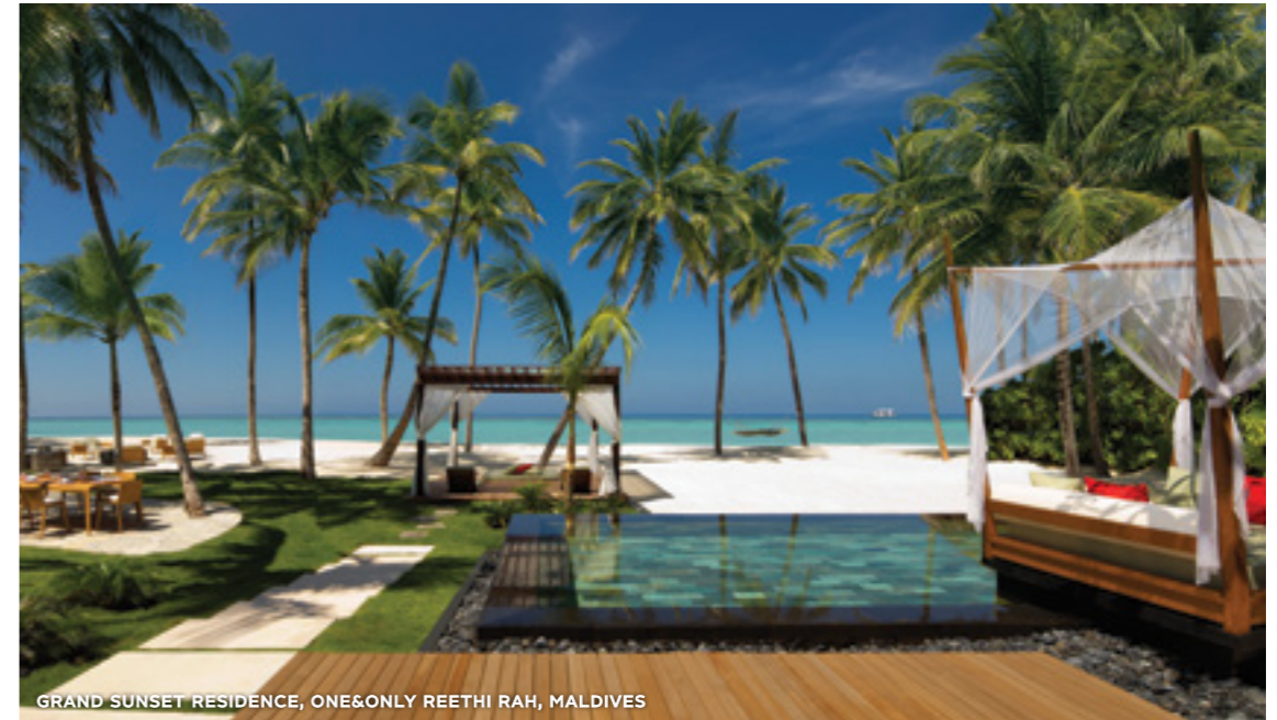
GRAND SUNSET RESIDENCE, ONE&ONLY REETHI RAH, MALDIVES

Penthouse Residences suggest another level of privacy altogether. One&Only Hayman Island, the coral fringed