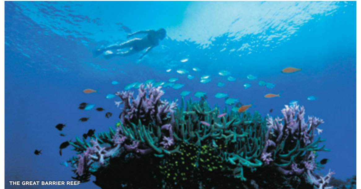
THE GREAT BARRIER REEF

There is only one private island plum in the centre of the Great Barrier Reef, where guests can immerse themselves in this natural wonder of the world and simultaneously indulge in the most stylish resort experience.