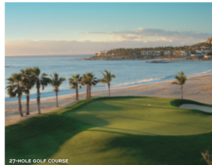
27-HOLE GOLF COURSE

An altogether different lure for many guests is The Palmilla Golf Club, home to Jack Nicklaus' first signature course built in Latin America, reputedly one of the finest layouts on the Los Cabos Corridor and remarkable for its varied landscape. The 27-hole course has