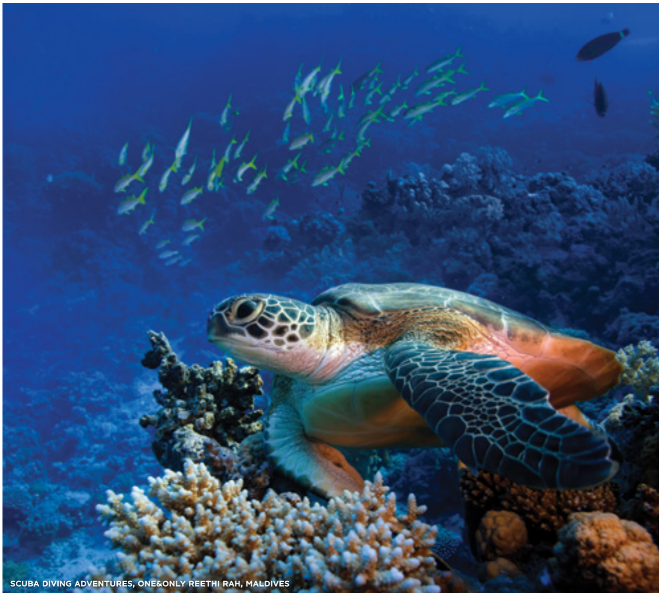
SCUBA DIVING ADVENTURES, ONE&ONLY REETHI RAH, MALDIVES