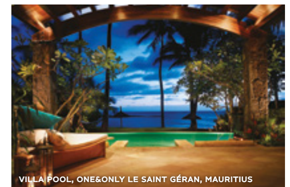
VILLA POOL, ONE&ONLY LE SAINT GÉRAN, MAURITIUS